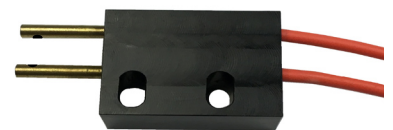
RAA-LT880 Transmissive Head