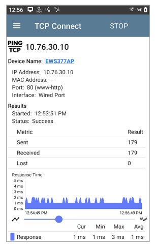
TCP Connect Screen